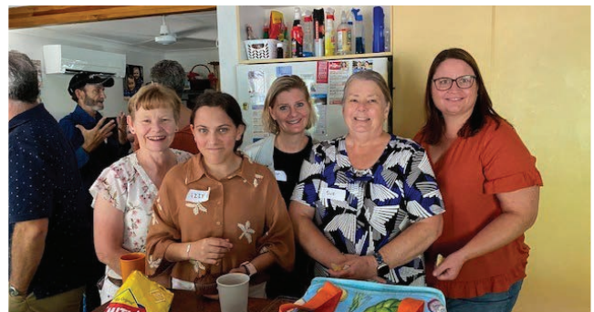
Paediatric Patient Reunion, Brisbane