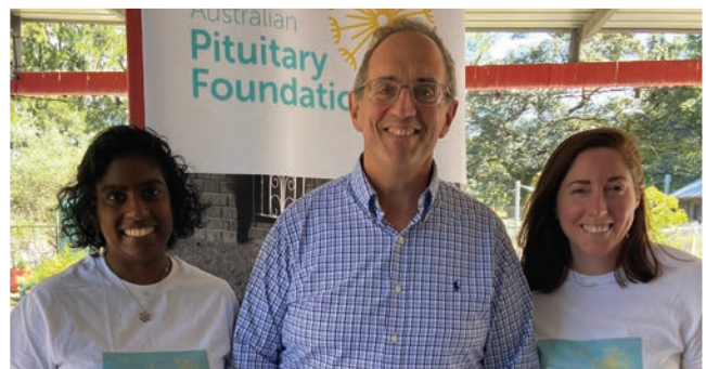
Pituitary Awareness Month Event, Sydney