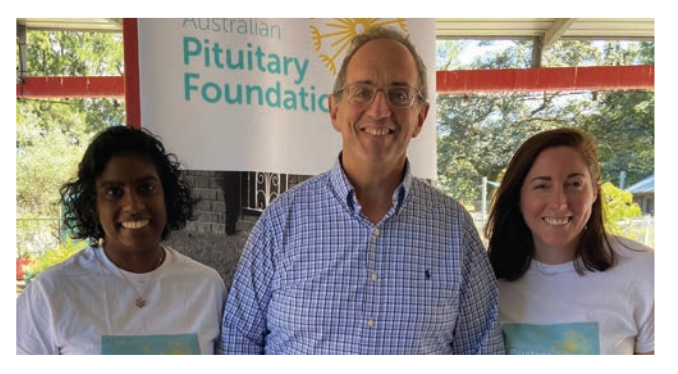
Pituitary Awareness Month Event, Sydney